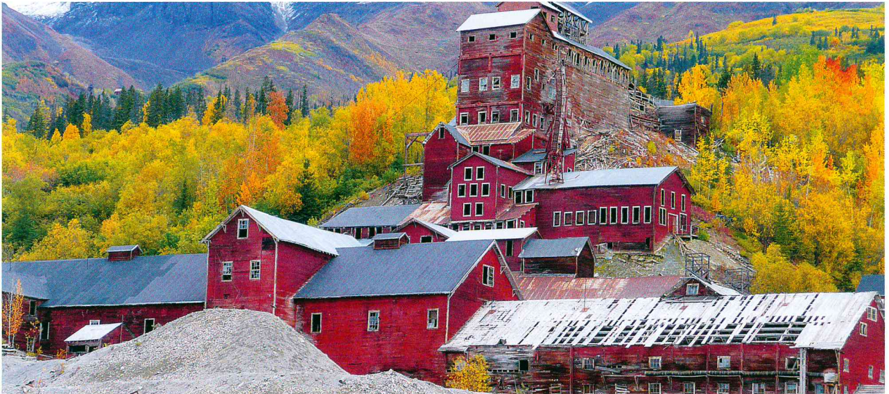
Kennecott Copper Mine

* Tour MA7 on Island Princess departures only, guests will enjoy Alaska Railroad service between Denali and Fairbanks.