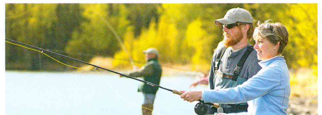
Flyfishing – Denali